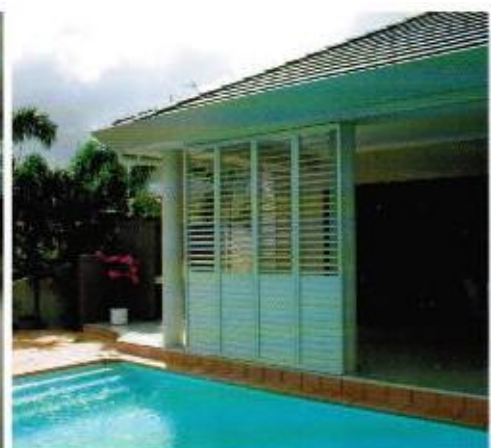
Sun protection & shading