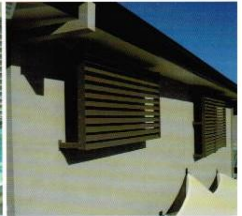
Fixed frame -window protection

Whether for Practical reasons or purely - as; an Aesthetic solution this truly is