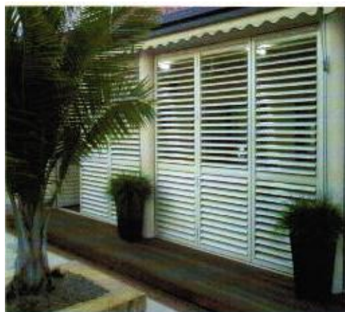
Increased living area

Louvre shutters are custom made to suit your specific requirements and available in a number of different configurations such as fixed, adjustable, stacking, bi-folding, sliding, hinged etc.