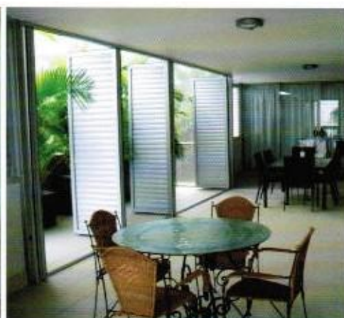
Comfortable living outdoors