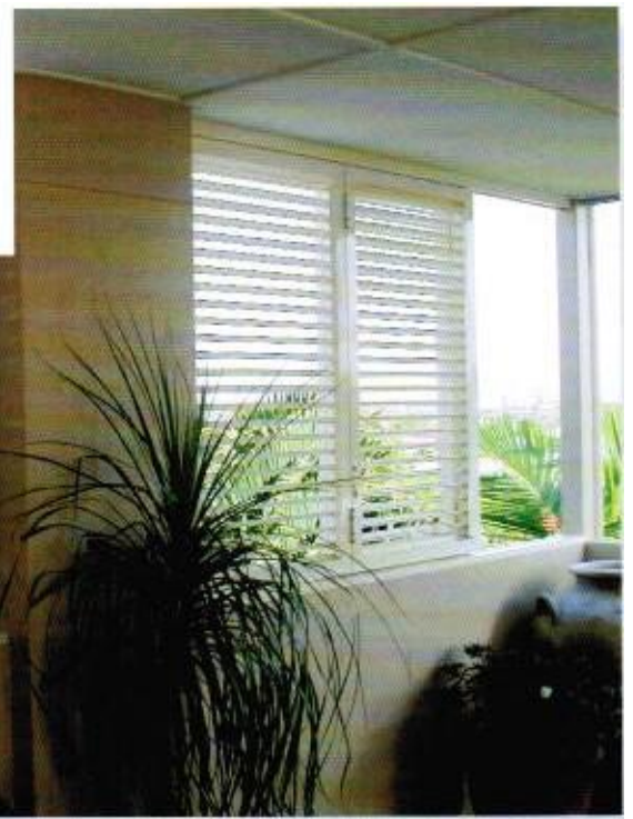
Stylish Protection from the Elements