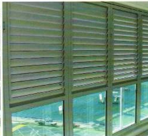
Louvre & glass combination