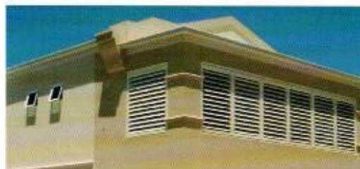
Energy Efficient - Energy Savings

The 90mm louvre blade has been specifically designed and engineered to cope with all types of weather conditions and have been tested for noise, wind load and resistance to wind pressures for cyclone regions.